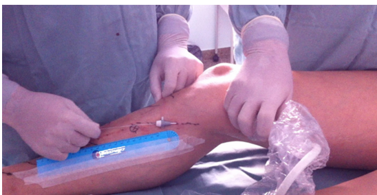
Figure 2. Puncture site and monitoring of progress of fiber with ultrasound.

vein system to rule out venous thrombosis. Doppler ultrasonography was conducted by an independent examiner, who was blind to the type of treatment provided, and patients were examined with the treated limb in orthostatic position. Normal flow was defined as anterograde, and reflux was defined as retrograde flow with a duration of 0.5 seconds after a Valsalva maneuver or manual compression and decompression of the distal portion of the limb. Obliteration was defined as an absence of flow in the segment being studied.