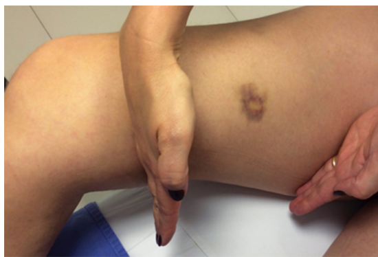
Figure 3. Control on day 7. Patient in group treated with tumescence, with minor bruising, indicating location of paresthesia.

In the majority of cases, varicose veins are the result of GSV incompetence, with or without incompetent perforating veins. Conventional treatment of the saphenous vein consists of ligation above the saphenofemoral junction and removal, which generally requires either general or spinal anesthesia. At many centers patients are still treated