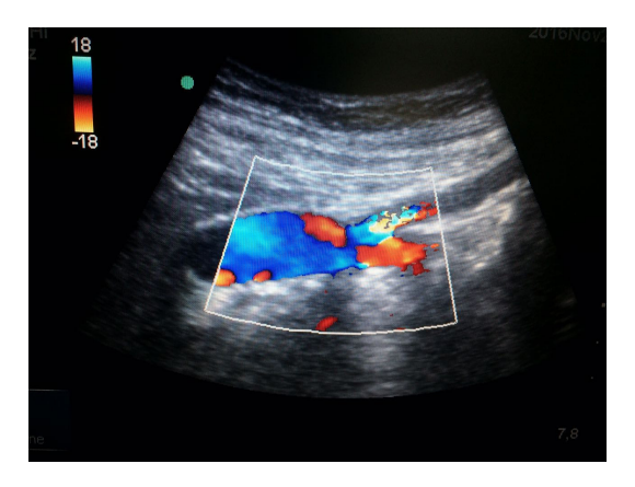
Figure 4. Longitudinal ultrasonography with Doppler for postoperative control, conducted 6 months after the procedure, showing the graft patent, with no stenosis, dilatations, or pseudoaneurysm formation.

The patient recovered well during the postoperative period and was discharged after 5 days in hospital. He is currently attending monthly follow-up consultations with regular assessments of the graft using vascular ultrasonography (Figure 4). To date he has been free from intercurrent conditions and has not suffered further episodes of exacerbation of his pancreatitis.