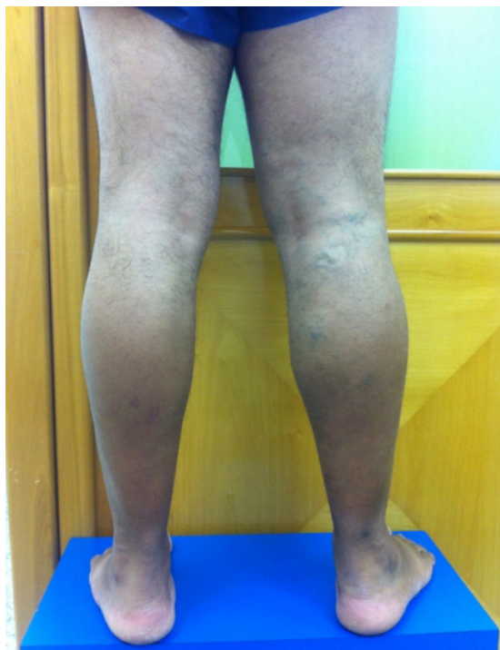
Figure 3. Lower limbs with patient standing upright, rear view, showing varicose veins in proximal leg.

to anatomic anomalies. Physical examination offers the tools needed to construct a diagnosis of CVI, but is insufficient to detect the structures involved or the extent of lesions. The initial work-up examination is therefore vascular ultrasound with Doppler, as was employed in this case, offering anatomic and hemodynamic analysis of the vascular structures involved, aiding with diagnosis and differentiation of