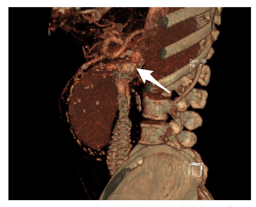
Figure 1. Reconstructed three-dimensional image shows a large, type la endoleak (arrow) and enlargement of the aneurysm to 120 mm in diameter, in the third year after the first repair.

A 70-year-old, hypertensive, male patient presented at the emergency unit with a complaint of continuous crescendo abdominal pain. The patient had been treated 5 years previously with endovascular repair of a symptomatic infrarenal, fusiform, 119 mm diameter abdominal aortic aneurysm (AAA), at another institution. An initial surveillance scan at the 6-month follow-up, prior to admission, using computed tomography (CT) angiograms and abdominal plain radiographs, had shown no evidence of endoleak or sac enlargement. The patient had no further follow up until the third year after the first repair, and then, in the third and fourth years after the first repair, had been treated twice for stent migration and type Ia endoleak with placement of a stent graft over the non-adhesive portion of the stent graft (Figure 1).