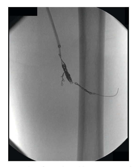
Figure 2. Release of microcoils to seal the communication with the pseudoaneurysm.