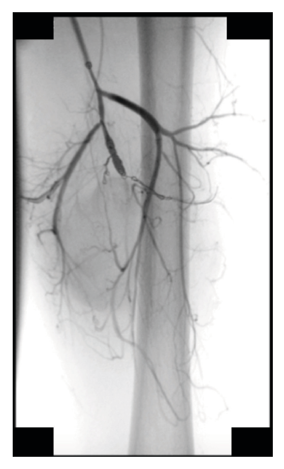
Figure 3. Immediate postoperative angiographic control.