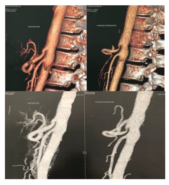
Figure 2. Multi-slice computed angiotomography with respiratory maneuvers - inspiration (left panels) and expiration (right panels). The typical hook-like downward stenosis of the celiac artery is due to the extrinsic compression by the arcuate ligament, especially at deep end expiration (right superior and inferior panels).