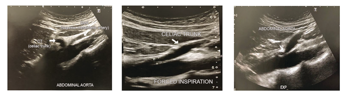
Figure 1. US images showing end-expiratory (right panel) compression of the CT. Left panel, at rest; central panel, with deep inspiration; right panel, with deep expiration. CT = celiac trunk; SMA = superior mesenteric artery; EXP = expiration.

CACS is a rare entity, which is diagnosed in only 2 of 100,000 patients with ambiguous upper abdominal pain.<sup>6</sup> The incidence of this disease is not known and typical symptoms are chronic or recurring epigastric pain (especially post-prandial), nausea, vomiting, diarrhea, weight loss, epigastric bloating, and reduced appetite. Since these symptoms may be caused by other diseases, like esophagitis,