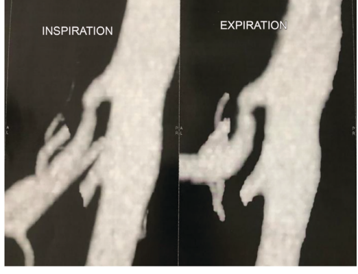
Figure 3. Postoperative multi-slice computed angiotomography with respiratory maneuvers - inspiration (left panels) and expiration (right panels) showing decompression of the celiac trunk.

pancreatitis, cholelithiasis, and food intolerance, CACS is a diagnosis of exclusion.<sup>3-5</sup>