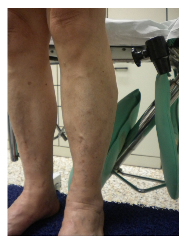
Figure 2. Postoperative image after CHIVA - No phlebectomy, sclerotherapy, laser or any other treatment was performed. Veins disappear due to lower transmural pressure.