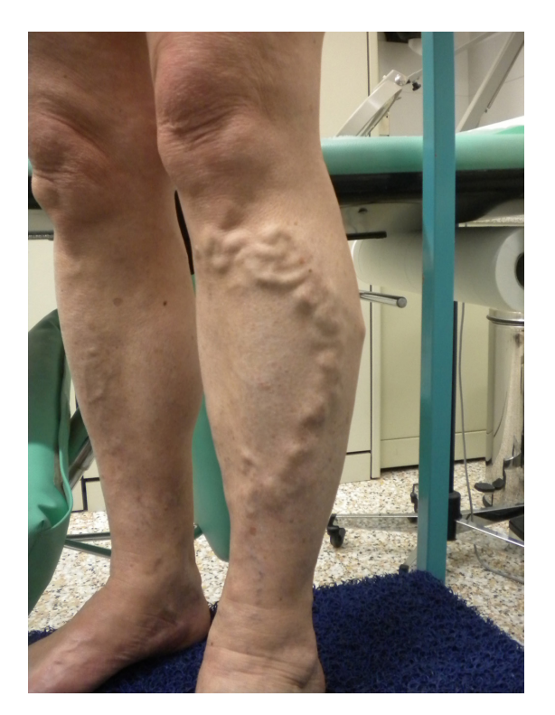
Figure 1. Preoperative image of a CHIVA patient.

The objective of this review article is to briefly describe the CHIVA technique and present the results of a technique that is a possible cost-effective alternative to the usual venous ablative/resective procedures.