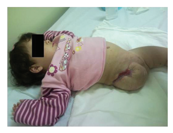
Figure 4. Post-amputation, already in healing phase.