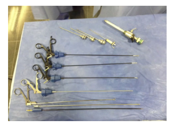
Figure 1. Needlescopic table set.

All procedures were carried out under general anesthesia and endotracheal intubation. The surgeon, the assistant surgeon, and the scrub nurse should be positioned on the same side of the operative target. The screen is on the opposite side, facing them. The patient is placed in a supine position with hyperextended flank and arms alongside the body.