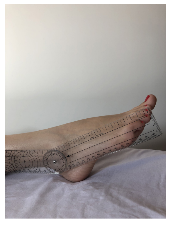
Figure 2. Goniometry of plantar flexion.

of plantar flexion mobility were taken by placing the fixed arm of the goniometer parallel to the lateral surface of the fibula, the moving arm parallel to the DISCUSSION lateral surface of the fifth metatarsal, and the angle over the ankle joint, against the lateral malleolus.9 Data were analyzed using IBM SPSS Statistics 2.0.10 The chi-square test was used to investigate whether there was a significant difference in the proportions of men and women whose ulcers had healed.