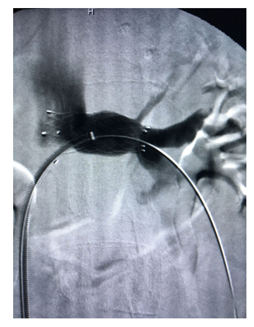
Figure 6. Control phlebography demonstrating complete resolution of left renal vein stenosis.