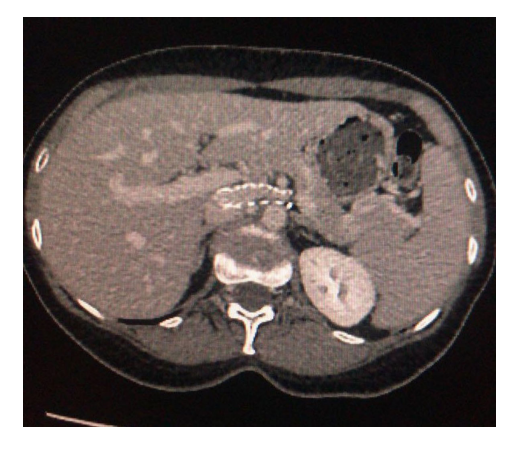
Figure 7. Control tomography showing patent stent 5 months after the procedure.