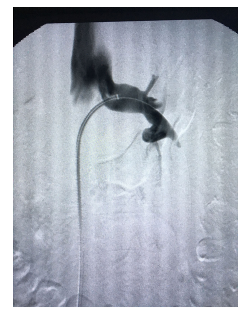
Figure 2. Phlebography showing stenosis of the left renal vein.