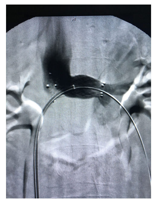
Figure 5. Placement of a stent in the left renal vein.