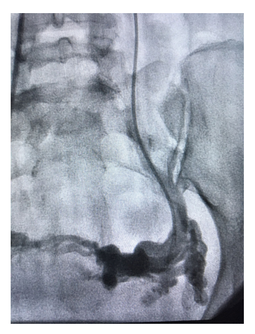
Figure 3. Pelvic varicose veins.

Control phlebography demonstrated complete resolution of the LRV stenosis (Figure 6).