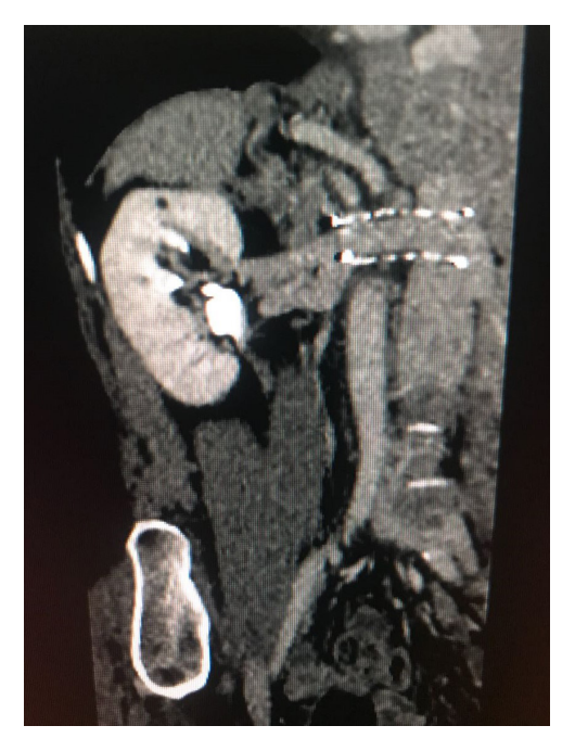
Figure 9. Patent stent on control tomography.

Five months after the endovascular treatment, the patient remained asymptomatic and was in outpatients follow-up at the clinic. During this period, control tomography showed the stent was patent and free from thrombi, with satisfactory correction of the renal compression (Figures 7 and 8). We did not observe residual stenosis, as shown by the control tomography. The stent is fully open and the renal vein free from stenosis (Figure 9).