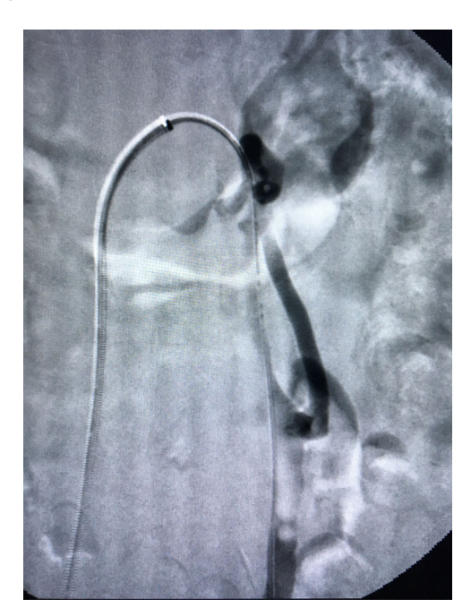
Figure 4. Gonadal vein.