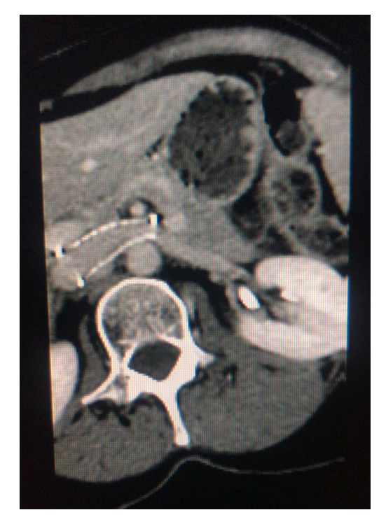
Figure 8. Control tomography showing patent stent 5 months after the procedure.

The patient agreed to publication of this case report and signed an informed consent form.