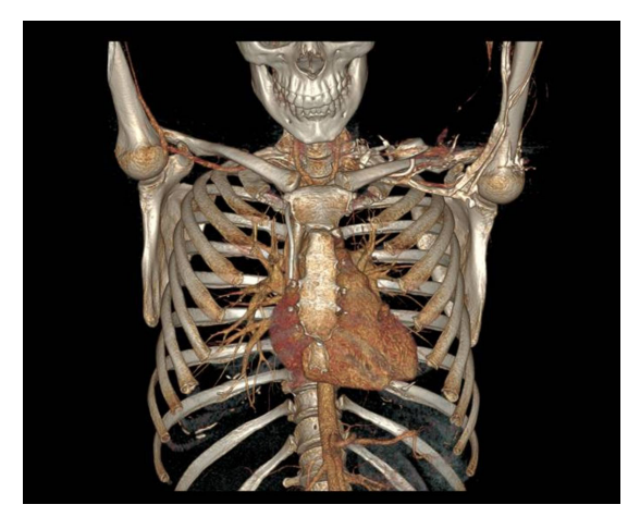
Figure 3. Three-dimensional computed tomography reconstruction also showing the catheter positioned in the right internal thoracic vein.