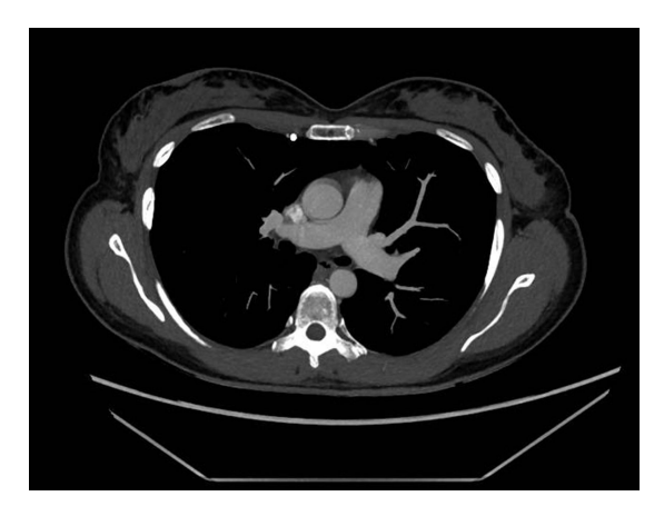
Figure 2. Axial computed tomography image showing the port-a-cath positioned behind the anterior chest wall.