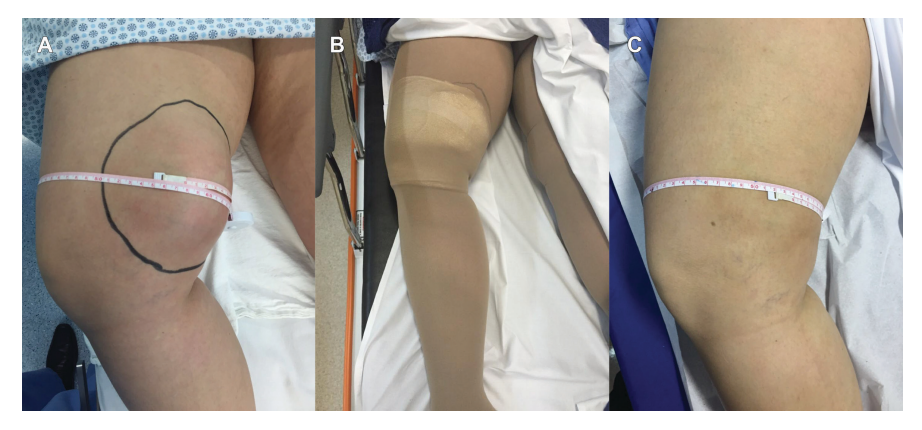
Figure 1. Images from Case 1: posttraumatic lymphocele. Swelling and local pain in the right medial thigh after a direct trauma (A). Wearing an elastic stocking over local compression dressing (surgical compress and micropore tape) after puncture to relieve pain and administer sclerotherapy with polidocanol (B). At follow-up appointment, patient is asymptomatic and wearing an elastic stocking. Control Doppler ultrasonography showed complete remission of accumulated liquid, and the elastic stocking was withdrawn (C).

with a volume of approximately 70 ml, via ultrasound-guided puncture, followed by injection of 10 ml of a solution of polidocanol 1% and room air at a proportion of 1:4 (Figures 3A and 3B). A compressive dressing with gauze and bandages was applied and a