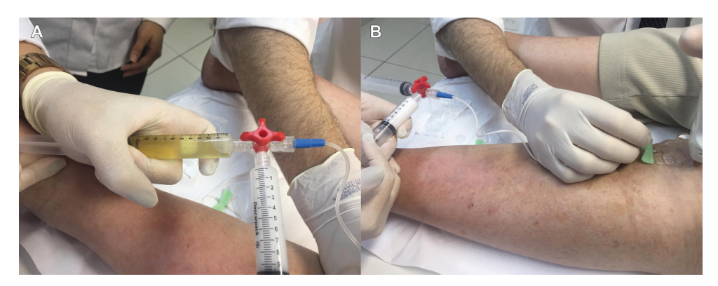
Figure 3. Images from Case 3: posttraumatic lymphocele. Drainage of approximately 70 ml of the lemon-yellow, serous liquid content by ultrasound-guided puncture (A). Injection of 10 ml of polidocanol solution 1% and room air at a proportion of 1:4 (after ultrasound-guided drainage) (B).