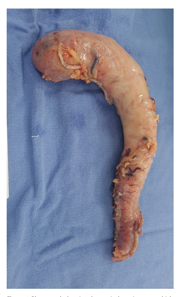
Figure 1. Photograph showing the surgical specimen on which LVG was performed. In this technique, vessels are sealed beyond a point 3 cm from the pylorus, working upwards flush to the gastric wall and within the gastroepiploic arch in the gastric body. The gastric fundus is released and the short gastric arteries are sealed. The stomach is thus vascularized by the left gastric artery only.

Patients with post-LVG portal vein thrombosis often have vague and nonspecific abdominal symptoms, such as nausea, abdominal distension and epigastric pain, which are common during the postoperative period after surgery on the digestive apparatus. Diagnoses of portal vein thrombosis were confirmed by abdominal angiotomography in the portal phase (Figures 2 and 3) in all patients who manifested any of these symptoms, even when nonspecific, looking for filling failures or increased caliber of the portal system vessels associated with an absence of contrast in the interior.