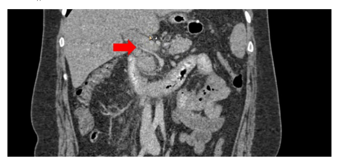
Figure 3. Photograph showing the portal phase of an abdominal angiotomography. The trunk of the ectatic portal vein can be observed with hypodense intraluminal content, characterizing portal vein thrombosis after laparoscopic vertical gastrectomy (LVG).

After diagnosis, all patients were transferred to the ICU and treated with unfractionated heparin (UFH), with an attack dose of 80 U/kg in bolus and a maintenance dosage of 18 U/kg/h, corrected according to the activated partial thromboplastin time (APTT), and vigorous hydration. Once the initial pain and abdominal distension had subsided, which took an average of 3 days, we moved to daily oral anticoagulation with warfarin sodium. Patients were discharged after achieving an INR (international normalized ratio) between 2.0 and 3.0.