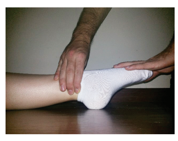
Figure 5. Plantar flexion maneuver(M5).

variables and presence of compression. Groups defined by presence or absence of compression were compared in terms of the quantitative variables using Students t test for independent samples or the Mann-Whitney nonparametric test. Multivariate analysis was conducted by constructing a logistic regression model taking compression as the dependent variable and variables that exhibited significance in the univariate analysis as explanatory variables. Values of p<0.05 indicate statistical significance. Data were analyzed using the SPSS v.20.0 computer program.