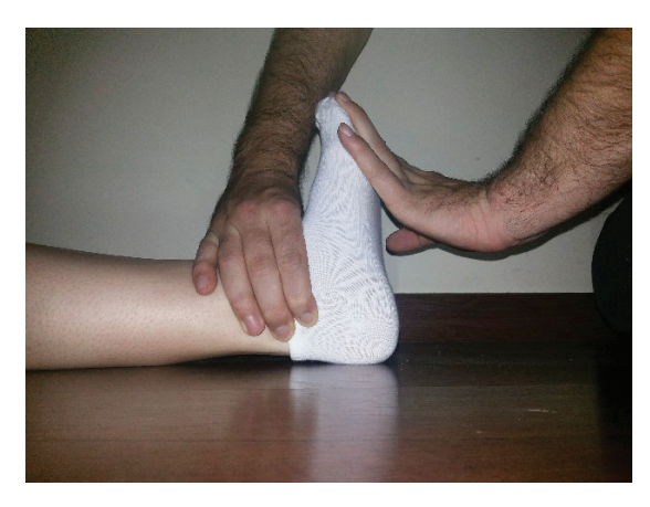
Figure 4. Dorsiflexion maneuver (M4).