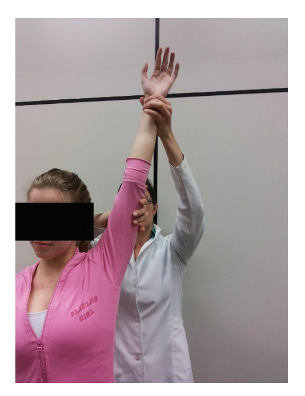
Figure 1. Hyperabduction maneuver (M1).

The popliteal artery entrapment tests consisted of taking distal pulses (pedal and posterior tibial) by palpation at rest and then with active and forced dorsiflexion (Maneuver M4) and plantar flexion (Maneuver M5) of the feet. The maneuvers are considered positive if the pulses are present at rest and absent during the movement (Figures 4 and 5).