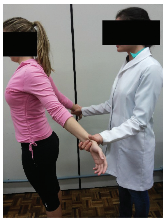
Figure 3. Costoclavicular maneuver (M3).