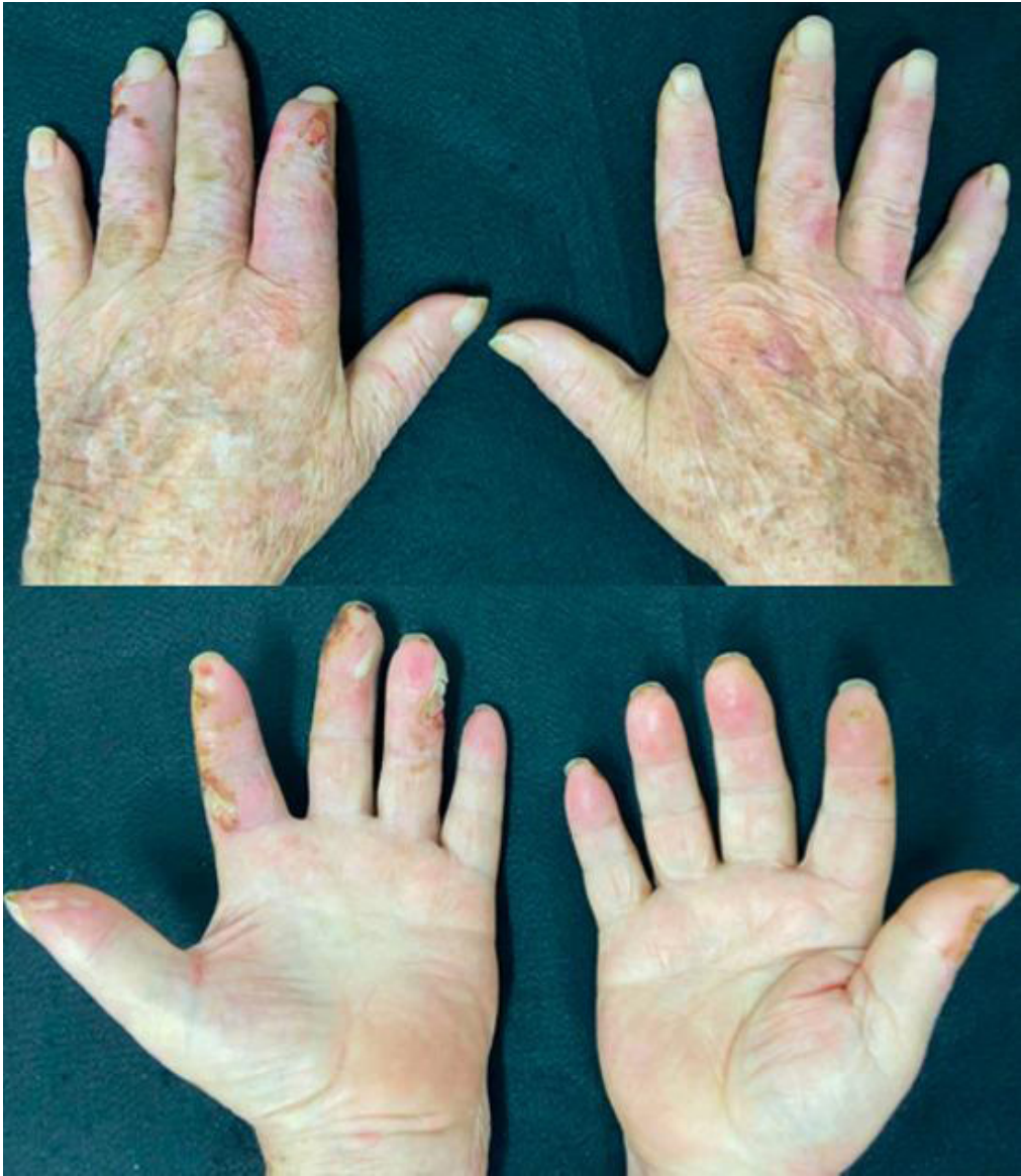
Figure 3. The same patient in April of 2021, with vesicles on the right thumb and a smaller quantity of exulcerations with fibrinoid base on the fingers.

indirectly via multiple pathways. Indirectly, hyperglycemia produces advanced glycation products that react with type 1 collagen and with epidermal growth factor receptor, suppressing cellular regeneration. High levels of serum glucose also lead to vasodilation dysfunction through inhibition of nitric oxide molecules, thereby dysregulating the blood supply to the skin. Hyperglycemia thus affects keratinocytes and fibroblast activity, causing changes to protein synthesis, proliferation, and migration, which are essential processes for maintenance of cutaneous integrity. 2