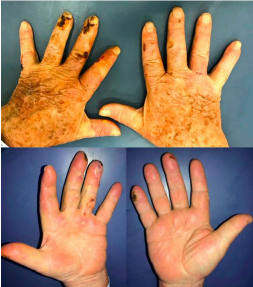
Figure 1. Hyaline vesicles on the third and fourth left fingers and exulcerations with necrotic scabs on the dorsal and distal fingers (December/2020).