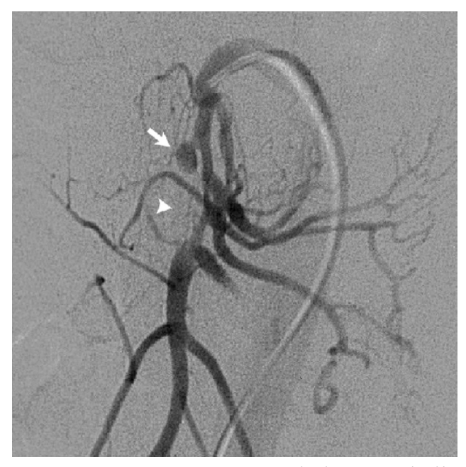
Figure 2 – Superior mesenteric CT angiography showing saccular dilatation on a proximal segment (arrow) and lumen compression next to the emergence of jejunal branches (arrowhead)

The procedure was performed under general anesthesia and clopidogrel 300 mg, an antiplatelet-aggregation agent. After femoral artery puncture and SMA catheterization, angiography showed saccular aneurysmal dilatation in its proximal third, followed by severe and extensive stenosis on the emergence of the jejunal branches, and slowing of the contrast flow to jejunoileal and colic branches, which characterize pseudoaneurysm with extrinsic compression of the arterial lumen (Figure 2). A 6-F guiding catheter was then introduced into the SMA ostium, followed by superselective catheterization of the pseudoaneurysm with microcatheter, and embolization with platinum controlledrelease microcoils. The stenosis was treated by implantation of a self-expanding nitinol stent (7 mm caliber). Control angiography showed adequate stent implantation, preservation of the trunk and branches of SMA, and improvement of blood flow to the bowel (Figure 3). One month later, CT angiography showed patency of the superior mesenteric artery and exclusion of the pseudoaneurysmal sac (Figure 4).