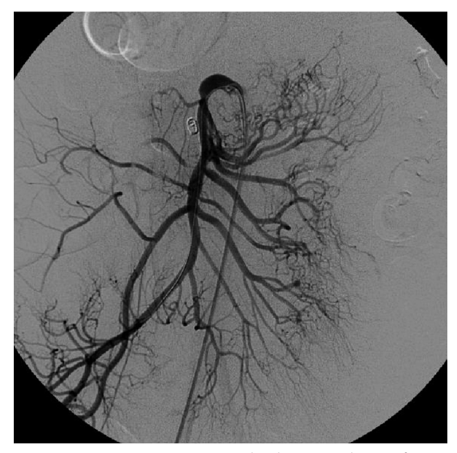
Figure \mathbf{3} – Post-treatment angiography showing exclusion of pseudoaneurysm, presence of coils and improvement of intestinal branches' perfusion

The SMA aneurysm was first described by Koch in 1951. DeBakey and Cooley described, in 1953, the first successful treatment of SMA aneurysm by resection without arterial reconstruction. Its incidence is underestimated due to its location, which makes the diagnosis