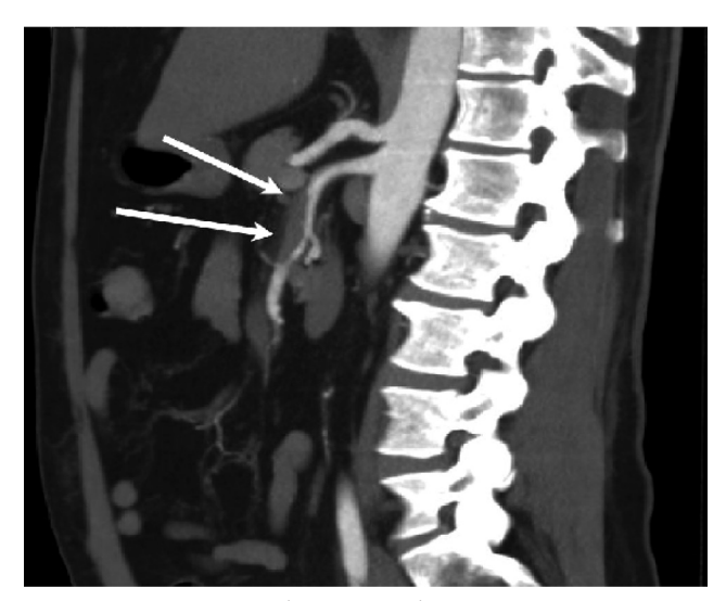
Figure 1 – CT angiography imaging showing superior mesenteric artery pseudoaneurysm with lumen compression by intramural thrombus

bacterial growth was not observed. After empiric antibiotic therapy, computed tomography scan of the abdomen showed a small residual collection measuring 1.8 x 1.4 cm on the VII segment. Simultaneously, an aneurysmal dilatation was detected on the proximal SMA with luminal thrombi, determining moderate stenosis (Figure 1). After clinical improvement of the patient, angiographic examination was scheduled, along with endovascular treatment of the aneurysm.