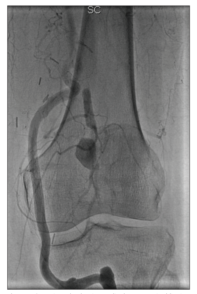
Figure 1. CT angiography showing popliteal artery proximal ligation, patent popliteal artery bypassed, and infrapatelar popliteal artery distal ligation. Note the aneurysm filling by multiple collateral branches.

We chose an endovascular approach in the Angiography Suite, with the patient under spinal anesthesia. The access