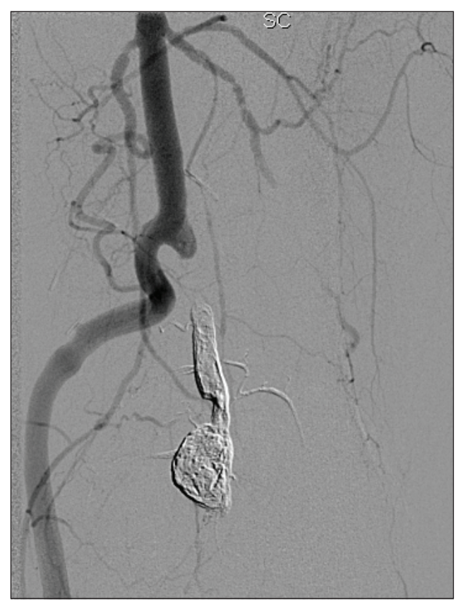
Figure 6. Follow-up CT angiography showing good flow through bypass, the radiopaque embolic material in the aneurysm, and collateral branches.