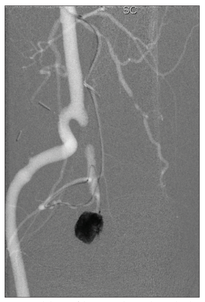
Figure 5. Embolization of the aneurysmal sace with \mathsf{Onix}^* liquid at roadmapping.

A Rebar 10° microcatheter was used on a 0.10 guidewire was positioned in the aneurysm sac and a further 1.5 mL of vial of Onyx° was injected. Control angiography showed normal arterial flow thorough the bypass, but no longer filling of the aneurysm sac (Figures 6 and 7). The patient was discharged from hospital on the next day, and was completely asymptomatic on follow-up visits at the outpatient clinic. Duplex scan a month later showed absence of flow in the medium portion of the popliteal artery and in the aneurysm, and patent popliteal artery bypass with triphasic flow in distal arteries.