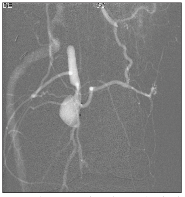
Figure 3. Roadmapping imaging showing the micro-catheter through the left superior genicular branch, with two radiopaque marks in the catheter's tip positioned inside the aneurysmal sac.