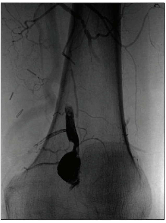
Figure 7. Late follow-up CT angiography showing radiopaque occlusive substance in the aneurysmal sac and the origin of genicular collateral branches.

success rate of 90%<sup>4</sup>. The most common complication of this surgery is bypass t occlusion, which may cause ischemic symptoms.