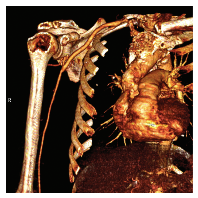
Figure 3. CT angiogram and three-dimensional reconstruction obtained after placement of arterial graft and PTFE prosthesis.