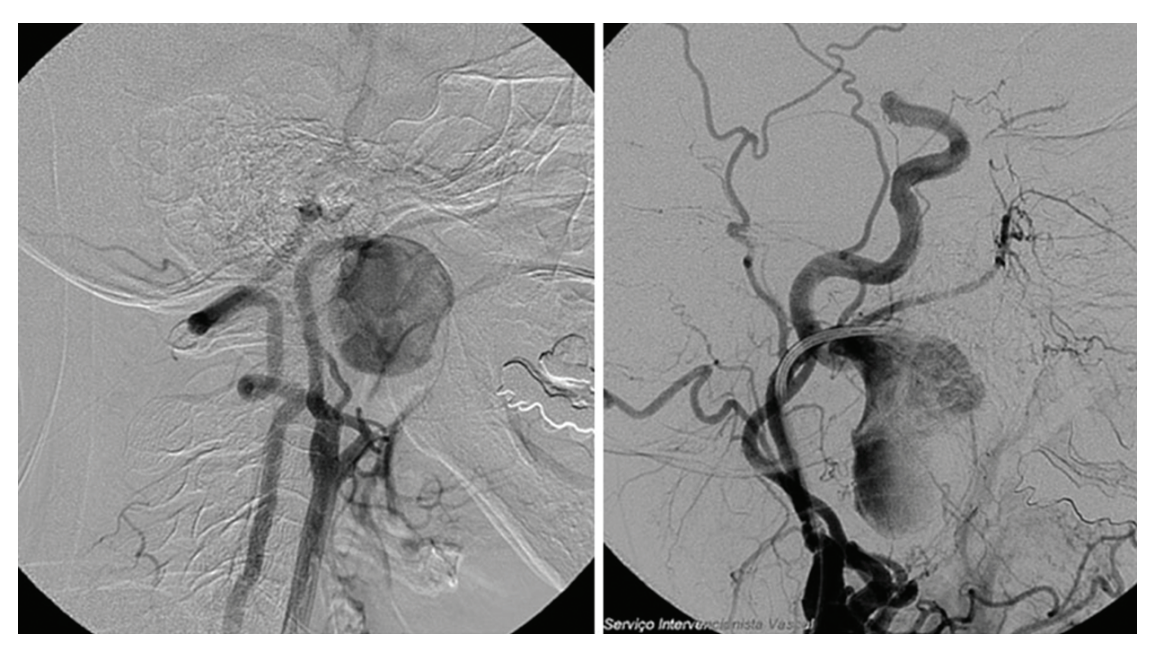
Figure 2. Selective arteriography showing internal carotid artery aneurysm near the skull base.

other nerves. The Doppler ultrasound performed at 30 days and at 6 months identified the Stent wellpositioned in the carotid bifurcation, and also the presence of flow across the whole path of ICA, with systolic and diastolic wave and velocities within the reference values and symmetrical, comparing both sides.