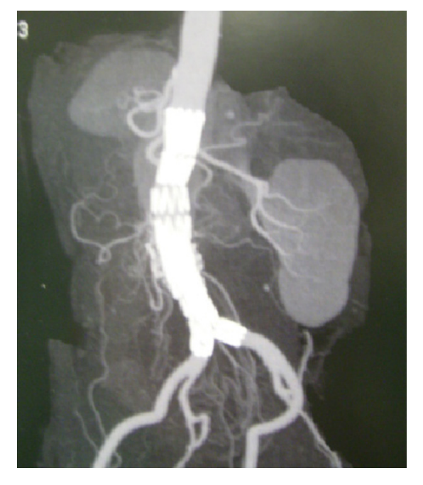
Figure 4. Angio-CT after endovascular repair.

late complication. The following complications may be listed: pseudoaneurysm (3%), thrombosis (2%), enteric erosion/fistula (1.6%), graft infection (1.3%), anastomotic hemorrhage (1.3%), colon ischemia (0.7%) and atheroembolism (0.3\%)^1 . They occur at a mean 10 to 12 years after operation, affect the distal anastomosis primarily<sup>2</sup>, and are asymptomatic until rupture, with a tragic outcome for the patient and the medical team.