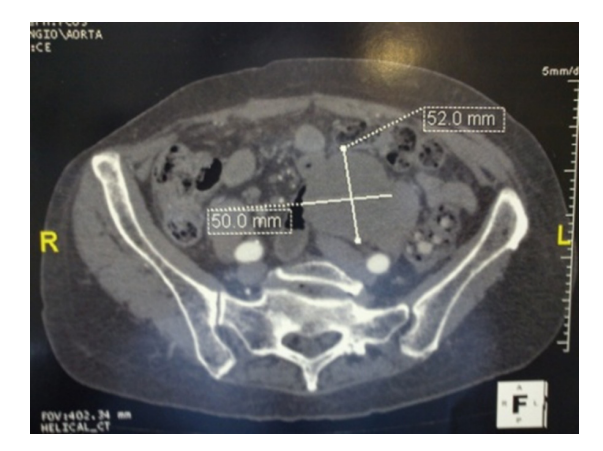
Figure 3. Angio-CT: axial view shows 52-mm pseudoaneurysm in distal anastomosis.