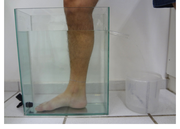
Figure 2. Volumetric assessment of postural edema.