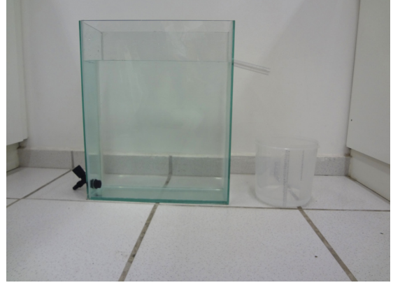
Figure 1. Vessel employed for water displacement volumetric assessments.

Statistical analysis was conducted using the ANOVA test for parametric data and the test of equality of two proportions for nonparametric data. The significance level adopted was p<0.05 and