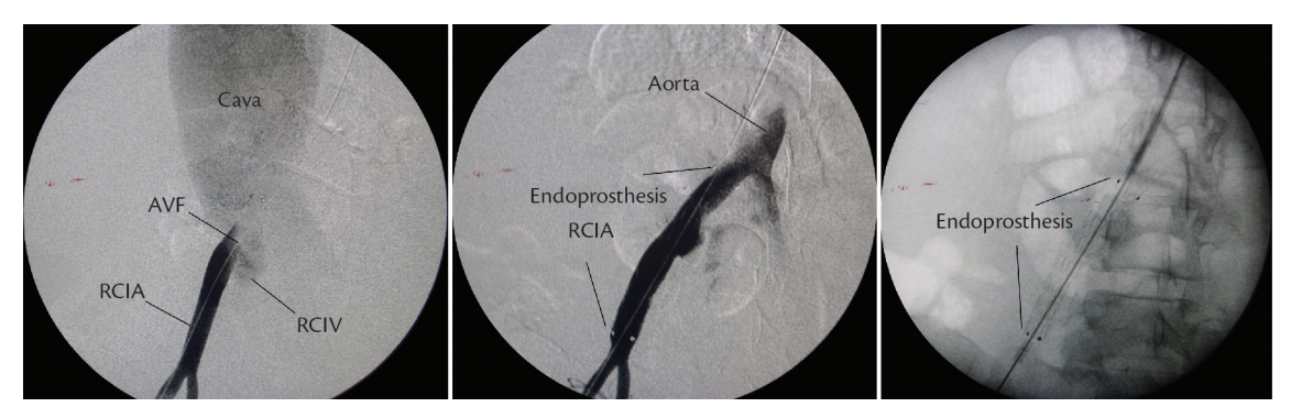
Figure 2. A- Preoperative arteriography with contrast in arterial phase of iliac veins and vena cava; B- Immediate postoperative arteriography showing absence of AVF; C- Endoprosthesis in RCIA.

On the seventh day after surgery, the patient began to show signs compatible with an incarcerated umbilical hernia, which was corrected surgically, with no further intercurrent conditions. She was discharged nine days after the operation on anticoagulation with Rivaroxabana.