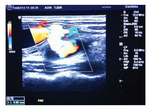
Figure 1. Color Doppler ultrasound showing an arteriovenous fistula between the common carotid artery and the left internal jugular vein.

During the operation, an intense inflammatory cicatricial reaction was observed, making it difficult to dissect vascular and neural structures. This meant that it was not possible to reconstruct the internal jugular vein and the decision was taken to ligate it.