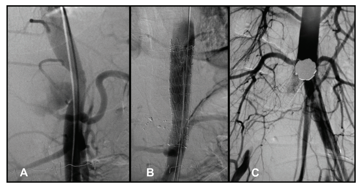
Figure 2. A) Digital subtraction arteriography showing a thoracoabdominal pseudoaneurysm approximately 2 cm from the celiac trunk. B) Results of endovascular treatment with an S- TAG endoprosthesis, achieving total occlusion of the pseudoaneurysm. C) Aortoiliac arteriography after placement of covered stent on right and self-expanding stent on left. Note the occlusion visible on the right and the negative image, suggestive of thrombus in the stent placed in the left common iliac artery.