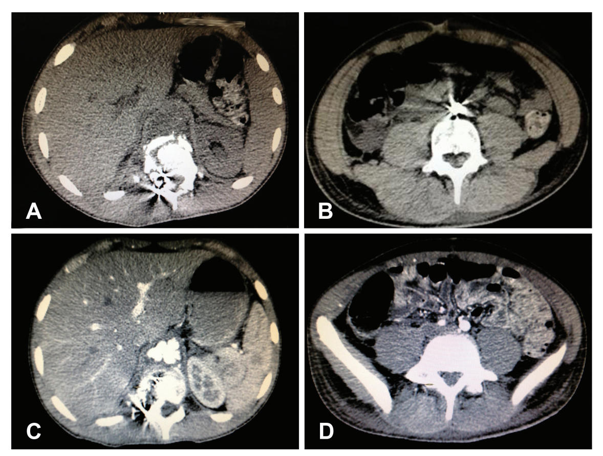
Figure 1. A) Tomography of the upper abdomen showing a projectile at the level of the 11th thoracic vertebra and a comminuted fracture of the vertebral body. B) Tomography of the abdomen 5 days after trauma showing that the bullet had migrated to the level of the fifth lumbar vertebra, in the aortic bifurcation topography. C) Angiotomography 5 days after trauma showing a thoracoabdominal pseudoaneurysm. D) Angiotomography showing occlusion of the right common iliac artery and filling of the external iliac artery.