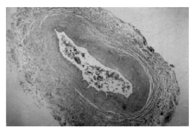
Figure 1 - Greater saphenous vein with intimal and circular muscular layers degree I and longitudinal muscular layer degree II (hematoxylin-eosin x 40).